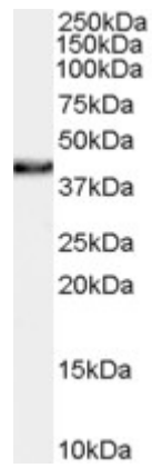
EB07440 (0.1 \mu g/ml) staining of Human Thyroid lysate (35 \mu g protein in RIPA buffer). Primary incubation was 1 hour. Detected by chemiluminescence.