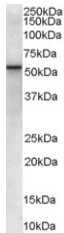
EB06832 (0.03 \mu g/ml) staining of Human Placenta lysate (35 \mu g protein in RIPA buffer). Primary incubation was 1 hour. Detected by chemiluminescence.