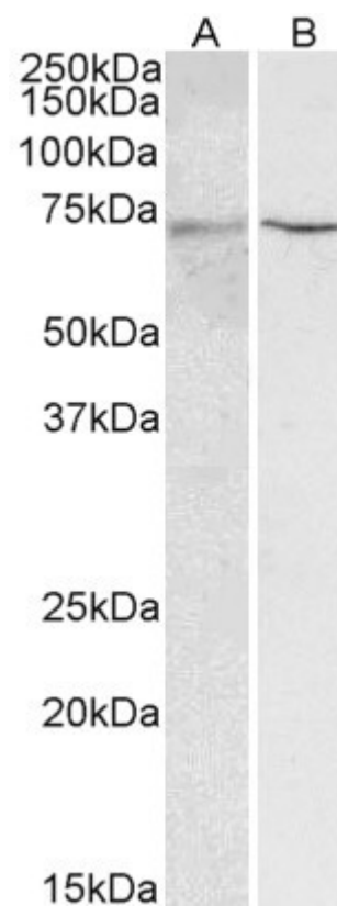
EB06701 (2 \mu g/ml) staining of Rat Liver (A) and Mouse Liver (B) lysates (35 \mu g protein in RIPA buffer). Detected by chemiluminescence.