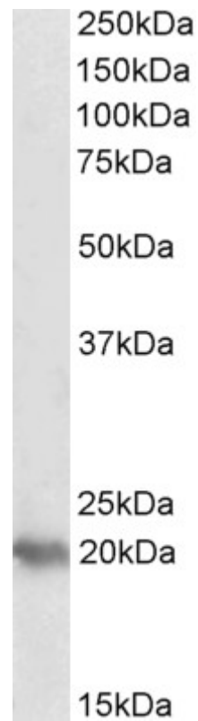
EB07234 (1 \mu g/ml) staining of Human Liver lysate (35 \mu g protein in RIPA buffer). Primary incubation was 1 hour. Detected by chemiluminescence.