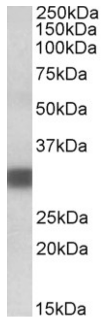
EB10505 (0.1µg/ml) staining of Human Heart lysate (35µg protein in RIPA buffer). Detected by chemiluminescence.