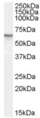
EB07935 (1 \mu g/ml) staining of Human Prostate lysate (35 \mu g protein in RIPA buffer). Primary incubation was 1 hour. Detected by chemiluminescence.