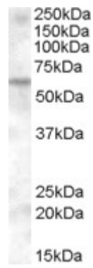
EB08538 (0.1 \mu g/ml) staining of Human Muscle lysate (35 \mu g protein in RIPA buffer). Primary incubation was 1 hour. Detected by chemiluminescence.