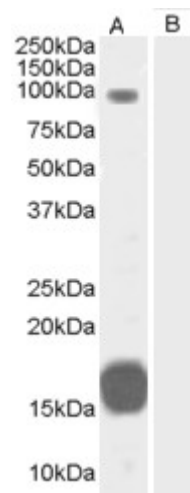
EB06142 (0.3 \mu g/ml) staining of Human Heart lysate (35 \mu g protein in RIPA buffer) with (B) and without (A) blocking with the immunising peptide. Primary incubation was 1 hour. Detected by chemiluminescence.