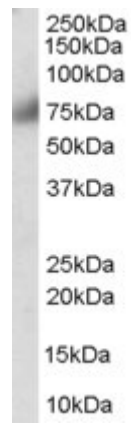
EB06649 (0.3µg/ml) staining of Human Breast lysate (35µg protein in RIPA buffer). Primary incubation was 1 hour. Detected by chemiluminescence.