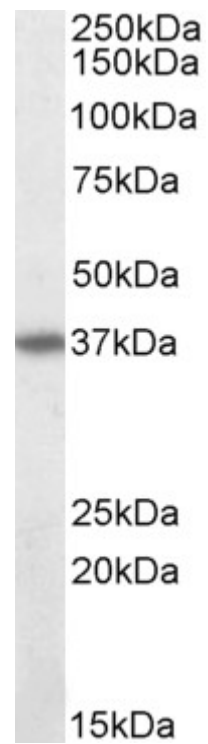
EB09626 (0.1µg/ml) staining of MOLT4 lysate (35µg protein in RIPA buffer). Detected by chemiluminescence.