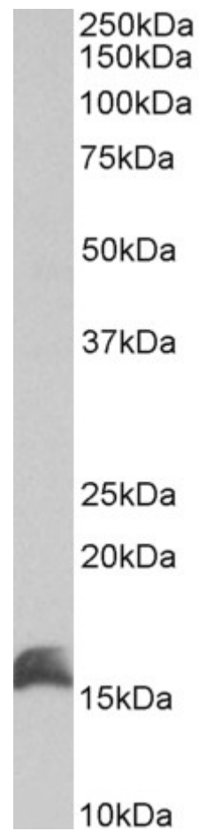
EB12230 (1µg/ml) staining of Kelly lysate (35µg protein in RIPA buffer). Detected by chemiluminescence.