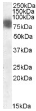
EB05253 (0.01 \mu g/ml) staining of Mouse Brain lysate (35 \mu g protein in RIPA buffer). Primary incubation was 1 hour. Detected by chemiluminescence.