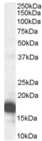
EB07094 (1 µg/ml) staining of HeLa Lysate (35 µg protein in RIPA buffer). Primary incubation was 1 hour. Detected by chemiluminescence.