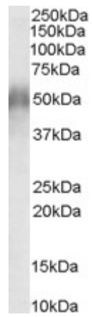
EB06414 (0.3µg/ml) staining of Human Thymus lysate (35µg protein in RIPA buffer). Primary incubation was 1 hour. Detected by chemiluminescence.