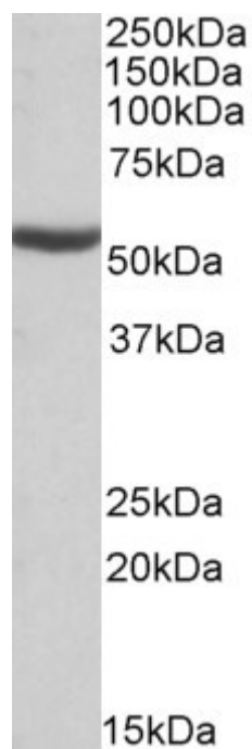
EB10438 (0.1µg/ml) staining of Mouse Kidney lysate (35µg protein in RIPA buffer). Primary incubation was 1 hour. Detected by chemiluminescence.